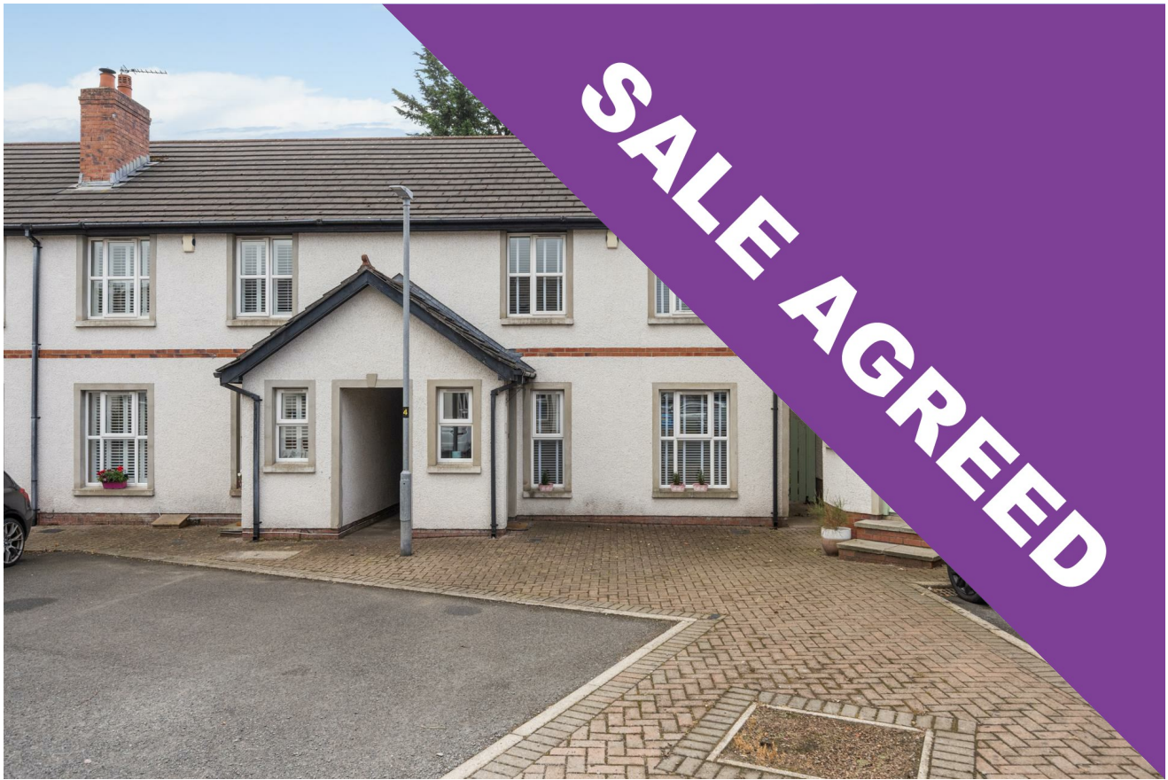
18 North Lodge Court, Carrickfergus, BT38 7TH